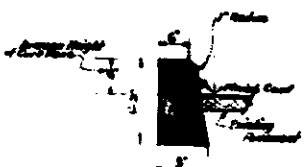
CURB SECTION SCALE 3/4"=1'-0"